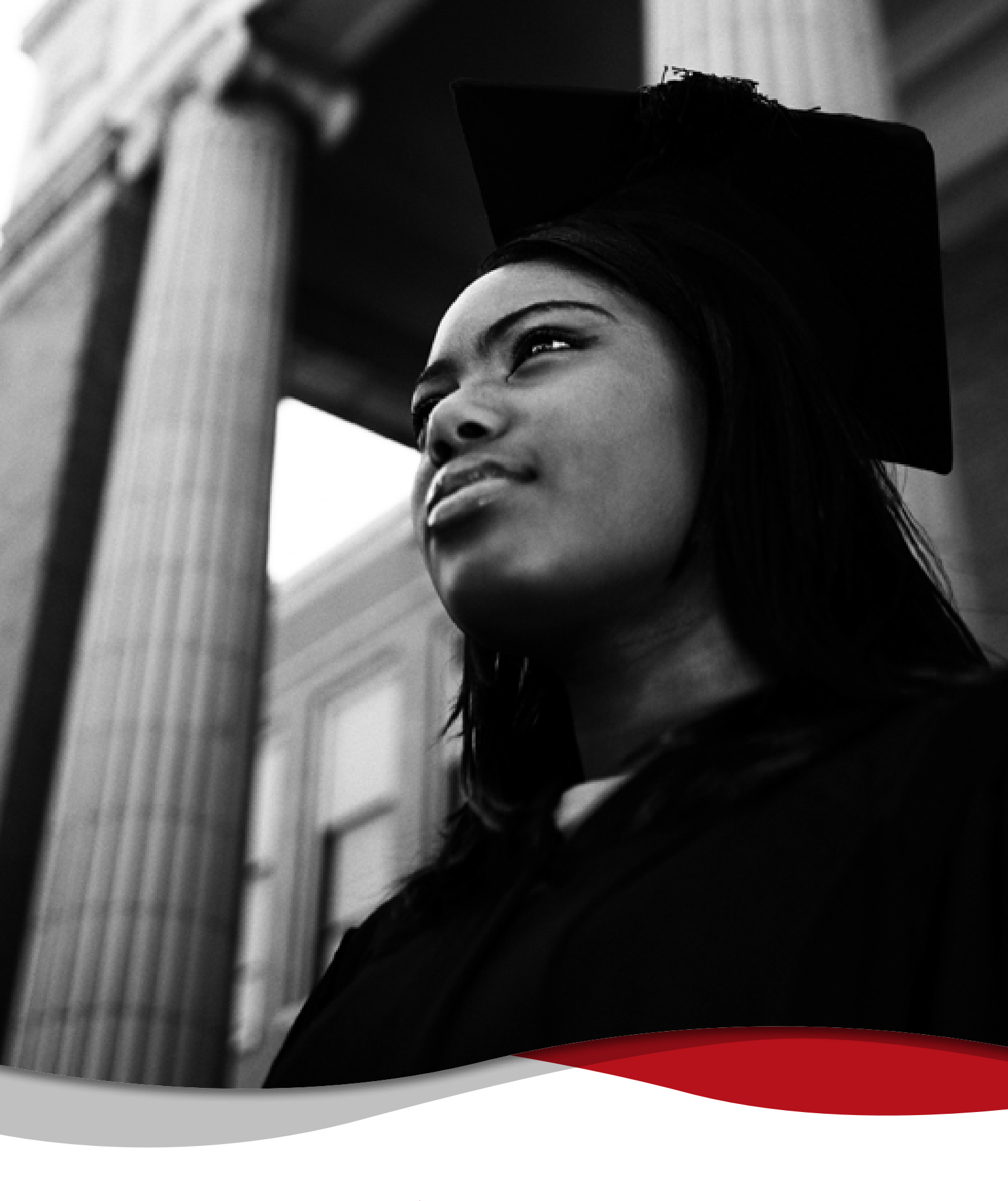
supporting success | improving higher education outcomes